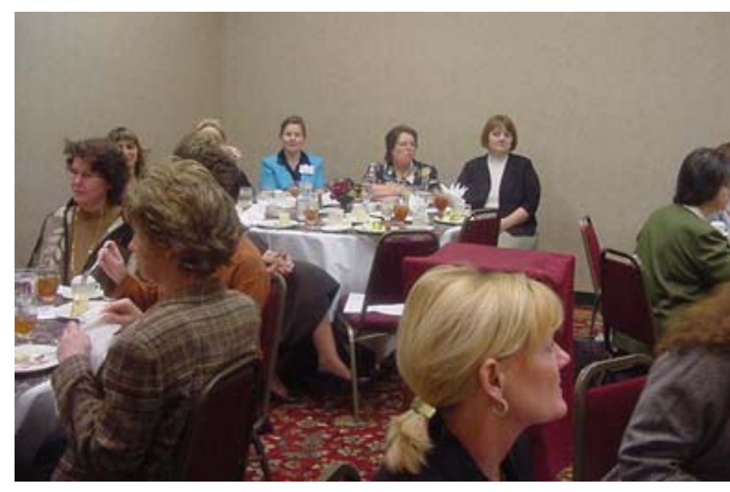
NTMCA Chapter at their November 2004 luncheon meeting.

NTMCA Members will be the TMCA Booth Committee for the TML Conference in Grapevine, October 25-29. ☆