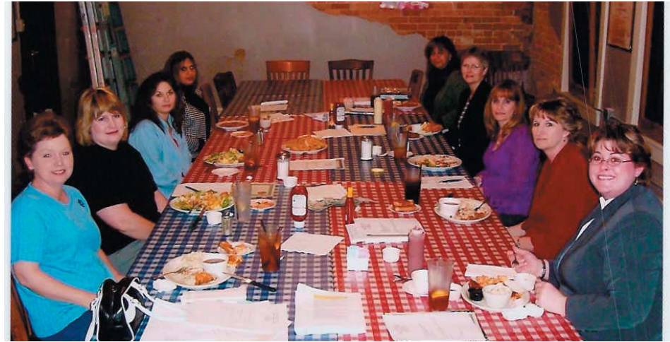
The Pineywoods Chapter at their January meeting.