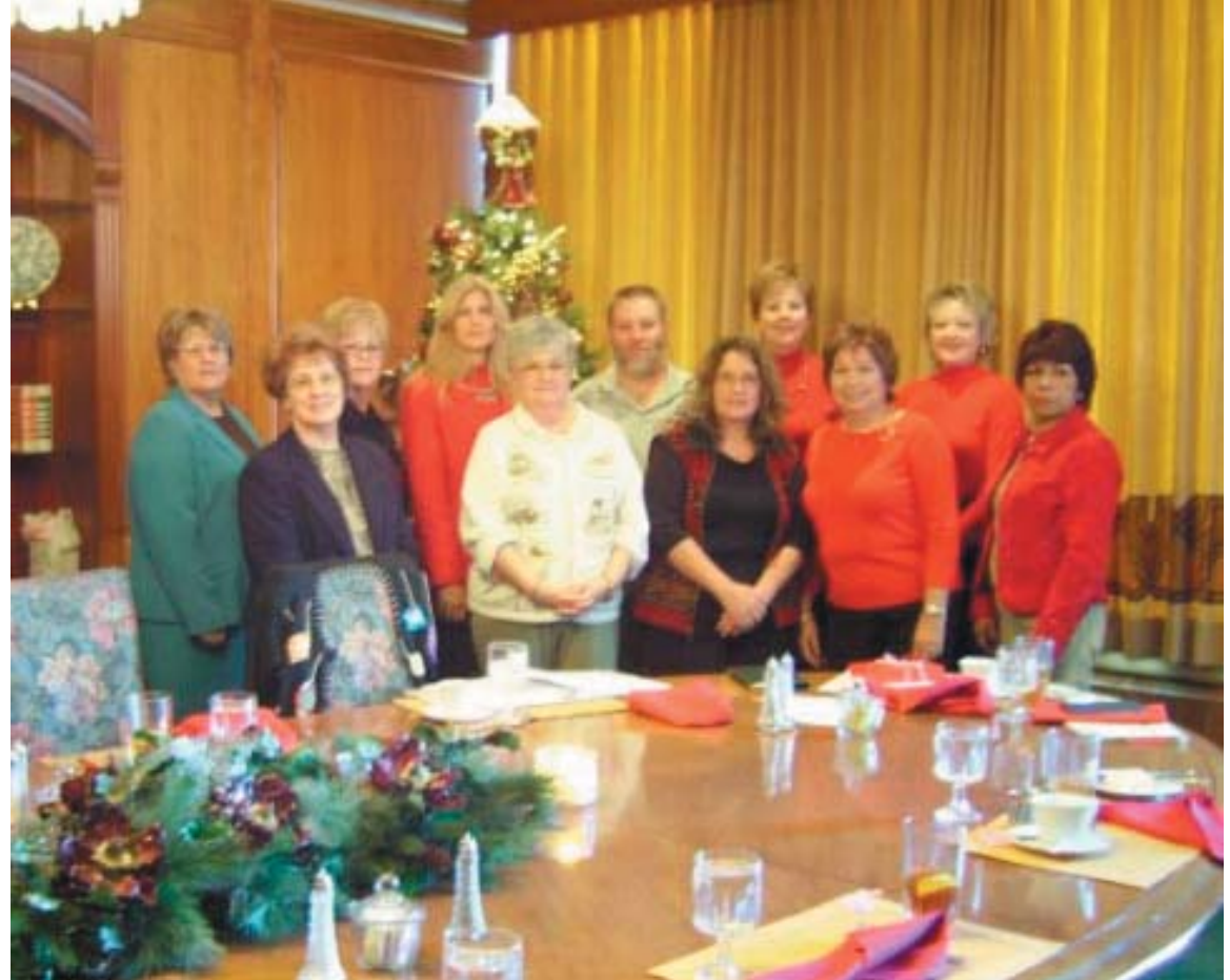
The Panhandle Chapter at their December meeting.