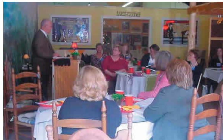
The Lone Star Chapter at their November meeting.