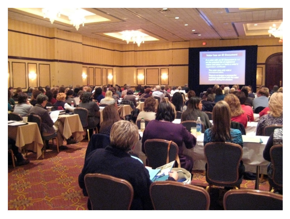
Attendees of the January 18-20 TMCCP Election Law Seminar in Irving.

Such was what we experienced in Irving recently at the Texas Municipal Clerks Election Law Seminar. Changes were made. Instead of four sessions that everyone attended at one time or another as in years past, attendees were able to pick and choose