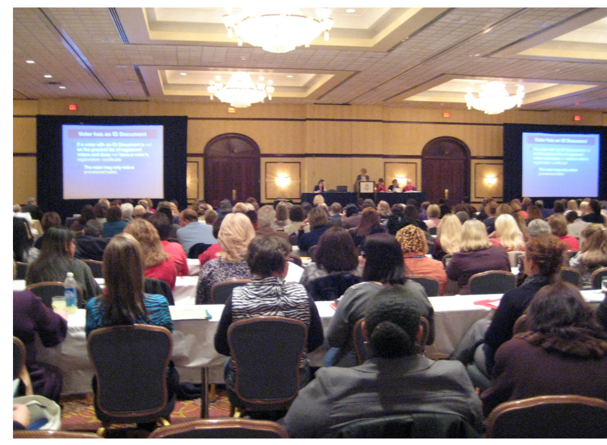
Attendees at the TMCCP Election Law Seminar Step-by-Step Pre-Seminar Session on January 18.

The January 2012 TMCCP Election Law Seminar in Irving was one of our most dynamic and educational seminars yet! The change in format received overwhelmingly positive feedback. Over 20 speakers taught over 500 attendees on everything from the latest information on DOJ submissions to provisional voting to polling place voting process—and much, much more.