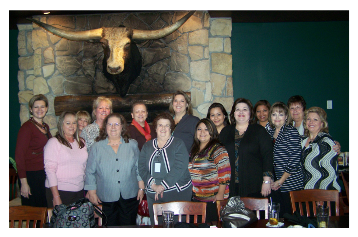
The Salt Grass Chapter at their January meeting in Houston.

The next meeting was set for February 13, hosted by the City of Seabrook.