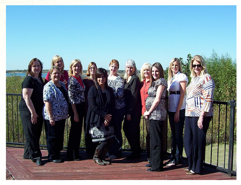
The Lone Star Chapter at their November meeting in The Colony.

Our December meeting was a holiday event in the City of Plano. We took time to recognize members who have earned their Texas Registered Municipal Clerk Certification (TRMC) or successfully passed a TMCCP exam. The group received updates regarding the legislative session and reports from our Scholarship and Audit Committees. Thanks to our Holiday Committee, members celebrated the season with fellowship and generously participated in our