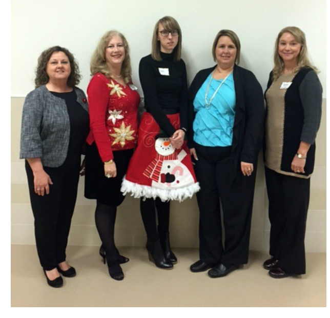
The new chapter board members were presented at the December meeting.

The meeting concluded and festivities continued with a Christmas ornament exchange at the end of the meeting, and every attendee taking home a Hutto Hippo cookie. *