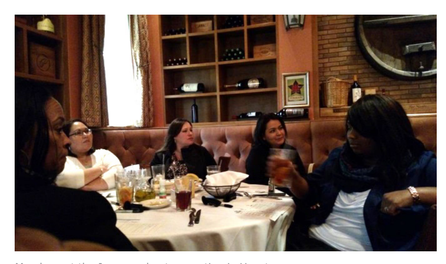
Members at the January chapter meeting in Houston.

The next Salt Grass Chapter meeting was set for February 11 in Tomball at Cisco's Salsa Company, Sol de Luna banquet room. Salt Grass Chapter meetings are typically held on the second Tuesday of the month, January through April and August through December—our meetings are open to anyone and we welcome visitors! ★