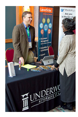
Platinum Level Seminar Sponsor Underwood Law Firm