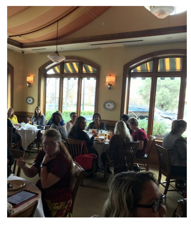
The Salt Grass Chapter at their January meeting in Houston.

The next Salt Grass Chapter meeting is set for March 8 in Friendswood. Salt Grass Chapter meetings are typically held on the second Wednesday of the