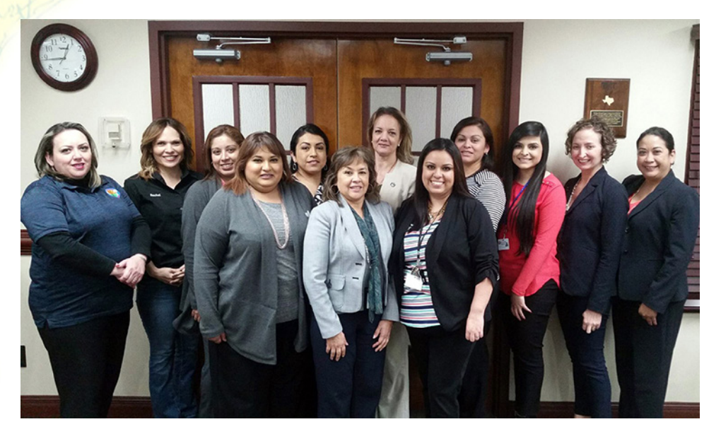
Above: Lower Rio Grande Valley Chapter members meet in the City of Pharr. Below left: New chapter officers are sworn in.

Lower Rio Grande Valley membership cities: Alamo, Alton, Brownsville, Donna, Edcouch, Edinburg, Elsa, Granjeno, Harlingen, Hidalgo, La Feria, La Joya, La Villa, Laguna Vista, Los Fresnos, Los Indios, Lyford, McAllen, Mercedes, Mission, Palmview, Penitas, Pharr, Port Isabel, Palmhurst, Raymondville, Town of Rancho Viejo, San Benito, San Juan, South Padre, Sullivan City, and Weslaco.