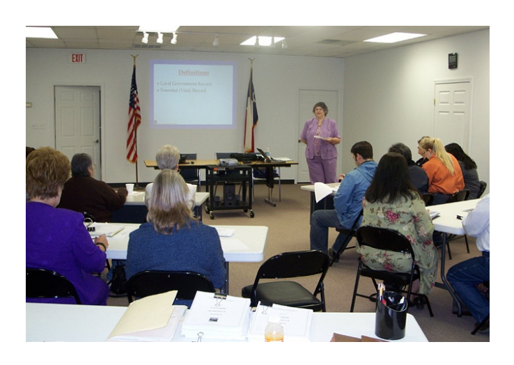
Above and below: The Coastal Bend Chapter at their meeting in Palacios.

Applications are now being taken for clerk of the year nomination. ★