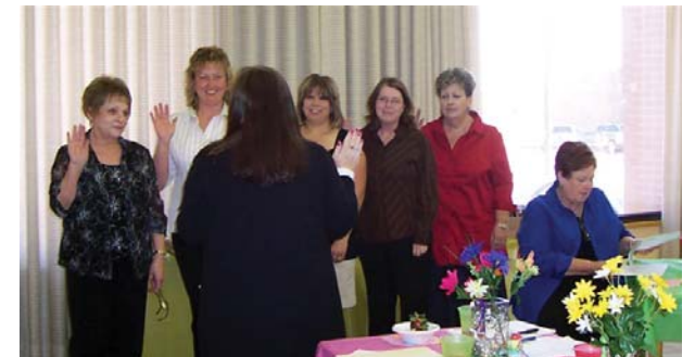
At right: Chapter officers are sworn into office.