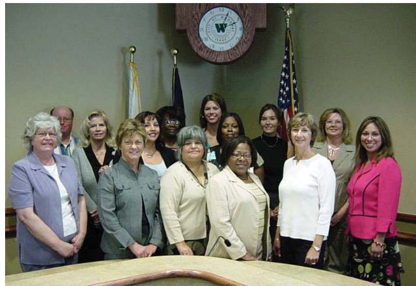
The Central Texas Chapter at their April meeting.

The next Central Texas Chapter meeting will be held on June 18 at the City of Mexia. ★