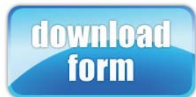
TMCA 2008 Retiree Data Sheet

The Retirement Committee has been busy gathering information on retirees through each TMCA Chapter President and the TMCA office. These wonderful retirees will be recognized at the Graduate Institute Annual Awards Banquet this October in Dallas. Each TMCA Chapter President has been requested to provide the committee with information on each retiree. Please feel free to contact your Chapter President or Retirement Committee member with this information. We do not want to miss anyone!