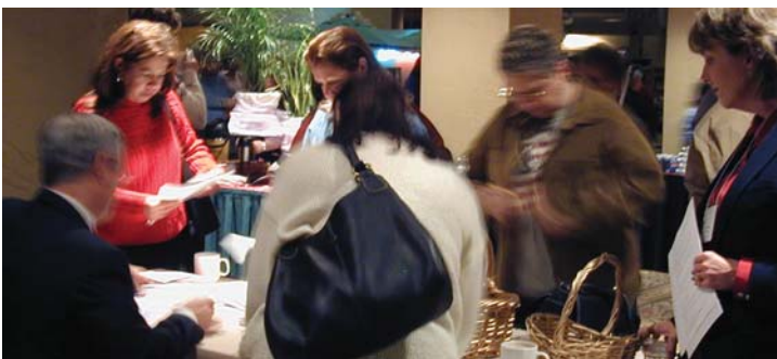
Top photo: 2004 Election Law Seminar - Attendees gather at the Pre-Seminar Session.