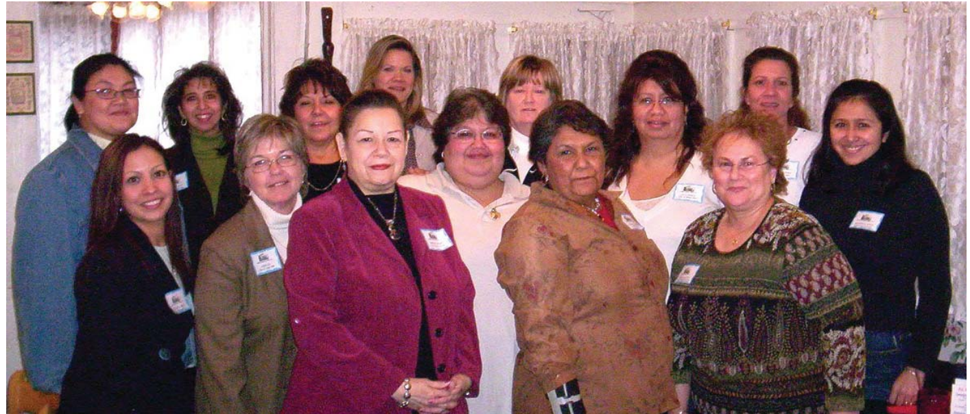
Above: Members of the Alamo Chapter during the January 25 Board Meeting/Luncheon.