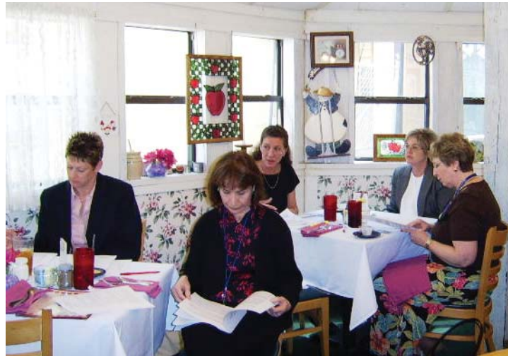
Members of the Alamo Chapter at the March 25 Board Meeting/ Luncheon at Apple Annie's Tea Room.