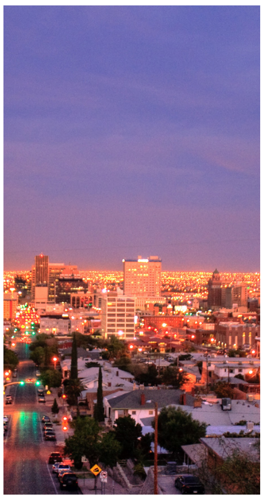
El Paso at Dusk by flickr user khowaga1. Photo licensed under a Creative Commons Attribution-Noncommercial 2.0 Generic License.