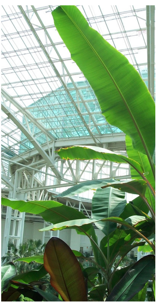
Inside the conference hotel, the Gaylord Opryland Resort & Conference Center in Nashville.