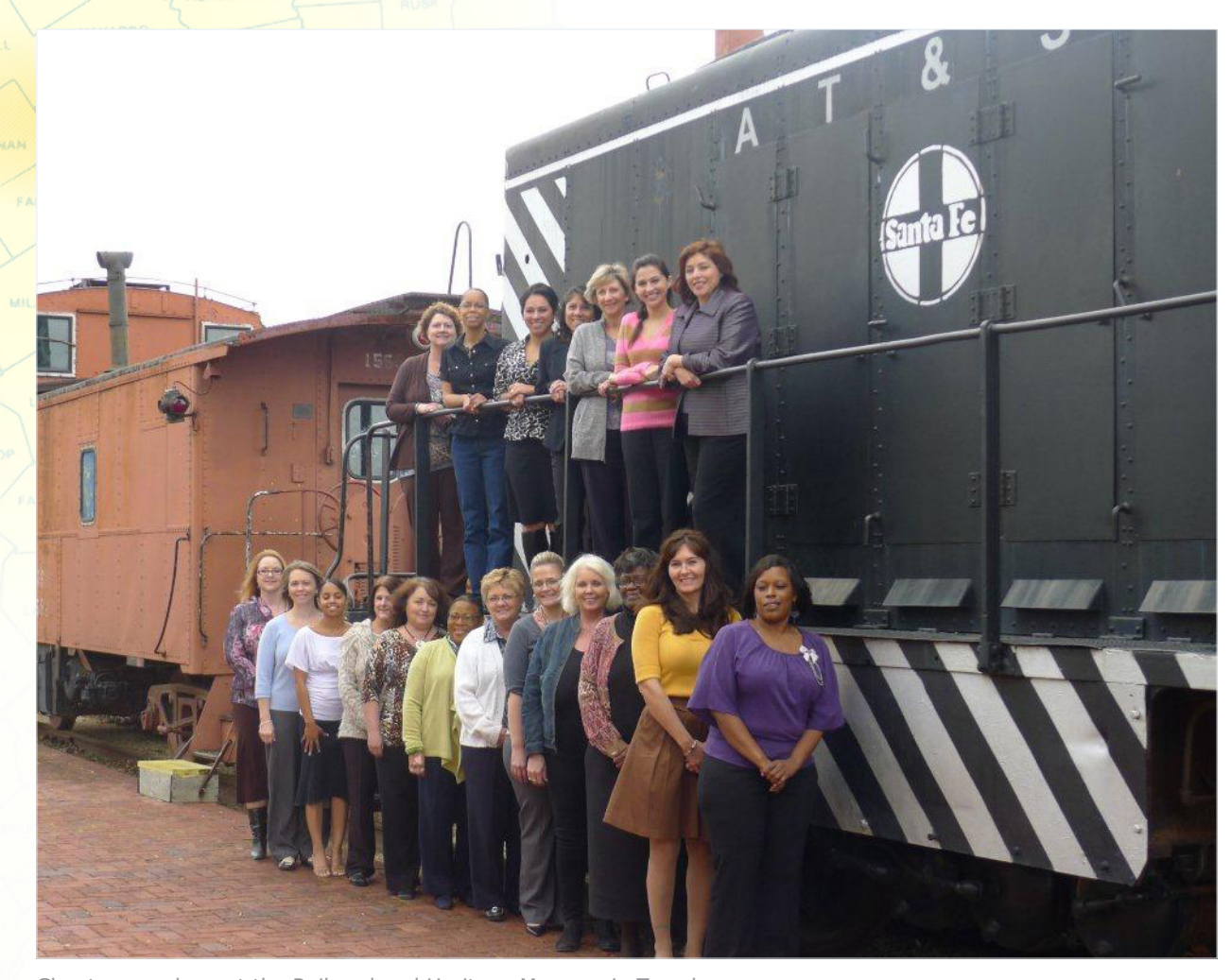
Chapter members at the Railroad and Heritage Museum in Temple.

More discussion was made on the annual Salado Seminar. This year it will be a one-day event with a reception to be held the evening before. Members discussed arrangements for speakers in the afternoon session.