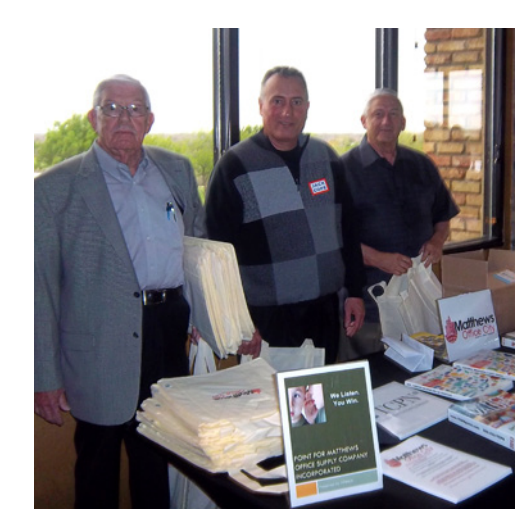
Matthews Office City