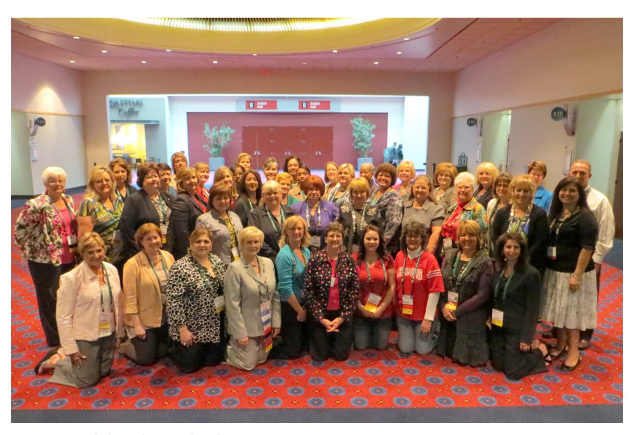
IIMC Region 4 clerks at the annual conference.

The institute directors met with staff and had lots of discussion among themselves about clerk education and what is working and what could be better. I was able to sit in on some of the conversations, and they were productive. IIMC is a growing and maturing organization, and since our principal mission is education we have to focus on ensuring that we are providing the best education for our clerks and that we are adapting to the changes in technology and budgets