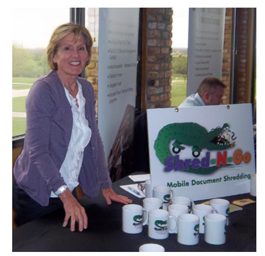
Shred N Go