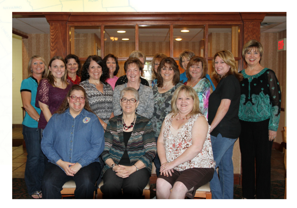
Northeast Texas Chapter members at the March meeting.

The Northeast Texas Chapter encourages its members to apply for its annual certification