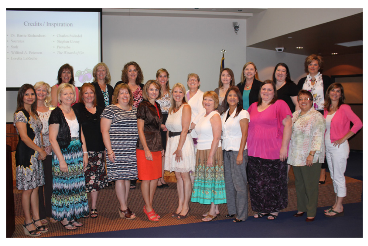
Attendees at the July 18 meeting in Highland Village.