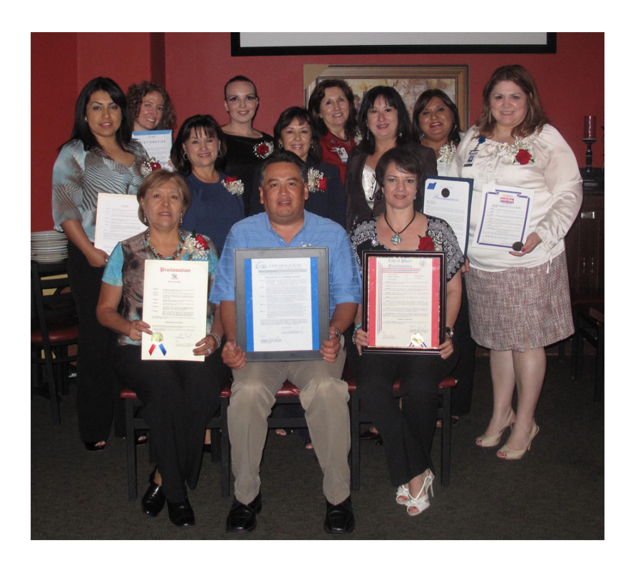
Lower Rio Grande Valley Chapter members pose with their proclamations (also pictured at left).