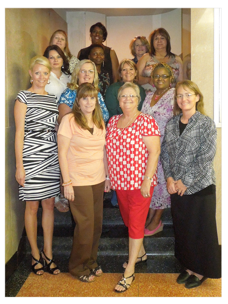
The Pineywoods Chapter Members at their June Meeting.