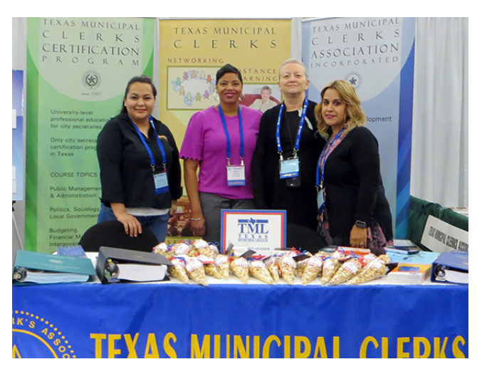
2017 TMCA booth at the Annual TML Conference

I look forward to seeing you in Fort Worth!