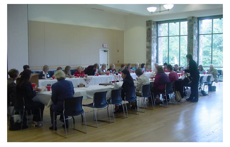
The Lone Star Chapter at their October 6 meeting.