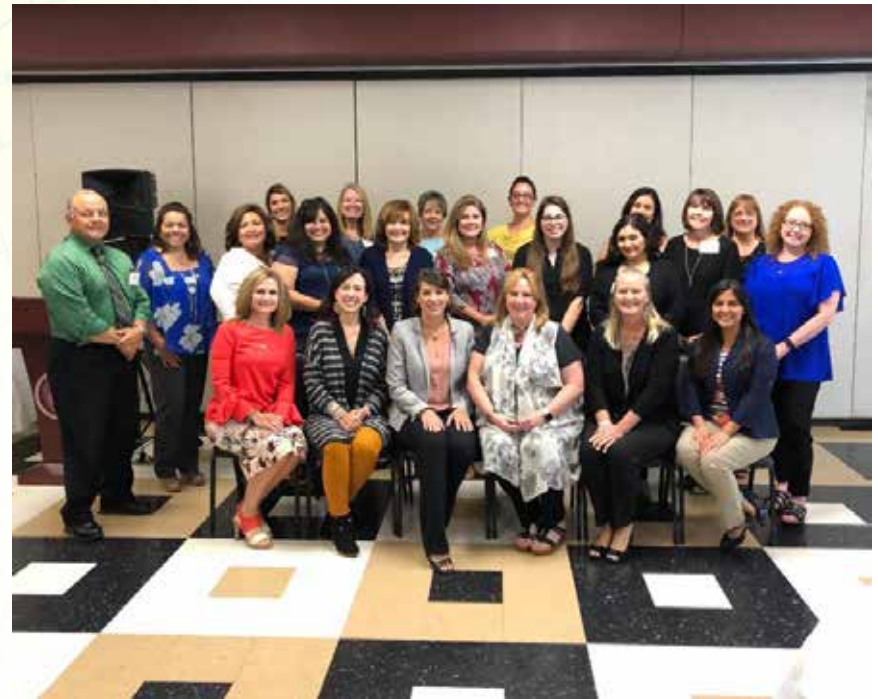
North Texas Chapter members at their August meeting.