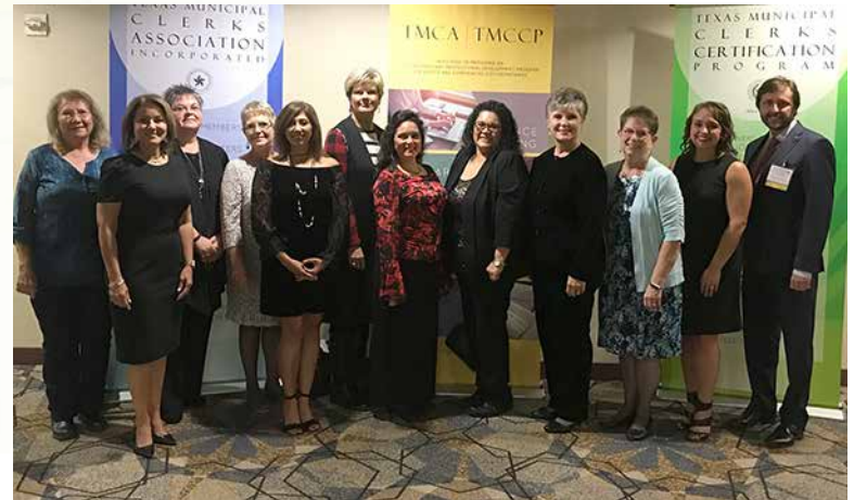
The chapter at their September meeting and at the TMCA banquet.

Members and guests in attendance at the September chapter meeting: