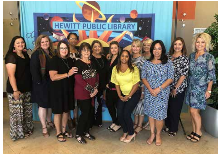
Central Texas Chapter members at their September meeting in Hewitt.