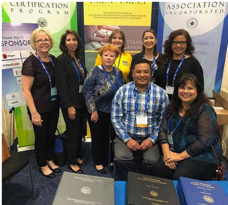
Volunteers and staff at the TMCA booth at the TML Conference