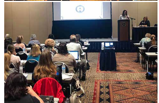
Pictures this page: The Salt Grass Chapter's 18th annual Public Information Act Seminar.