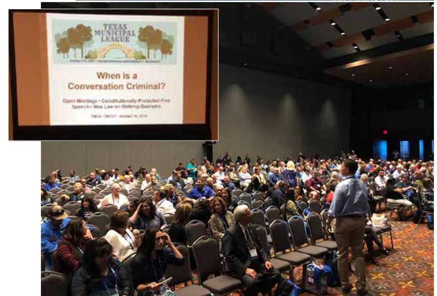
At top: Volunteers at the TMCA booth at the TML Conference. Above: Attendees of TMCA's Affiliate Session at the TML Conference.