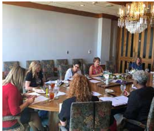
The Panhandle Chapter at their August meeting.

The chapter had their normal business meeting with the reading of the minutes and treasurer's report. The bylaws for the Panhandle Chapter were set forth and adopted and our new 2020 officers were approved.