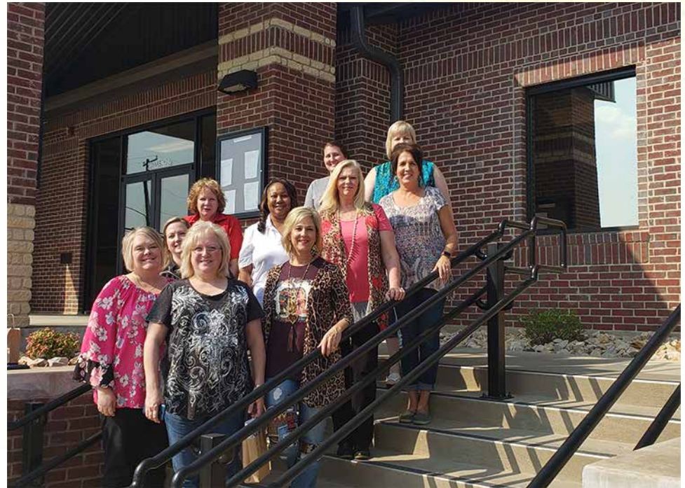
The Northeast Texas Chapter at their October meeting in Canton.