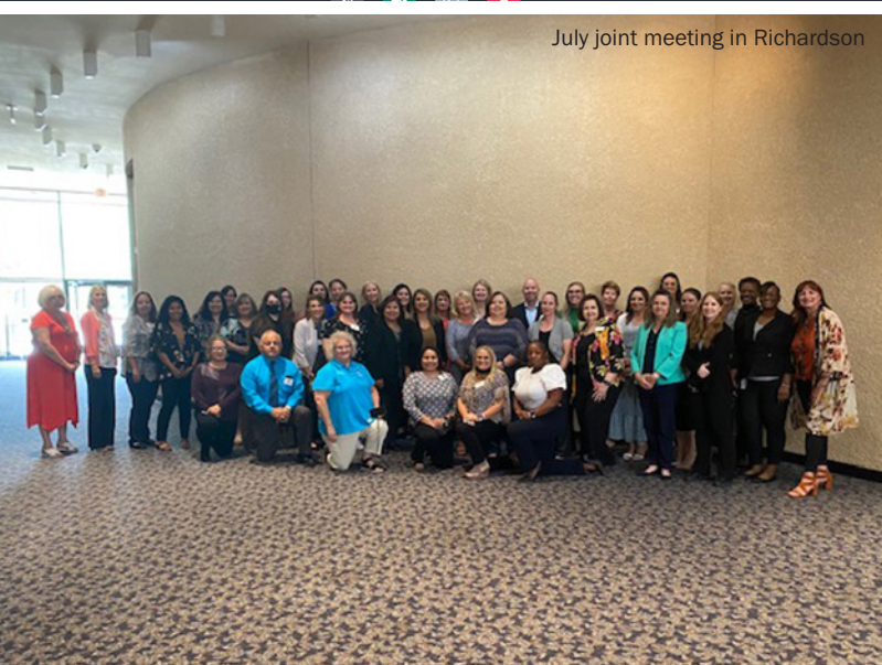
July joint meeting in Richardson