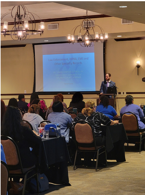
Top right: Missouri City staff and Attorney General's Office attorneys at the chapter's 21 st Annual Public Information Act Seminar in Missouri City.