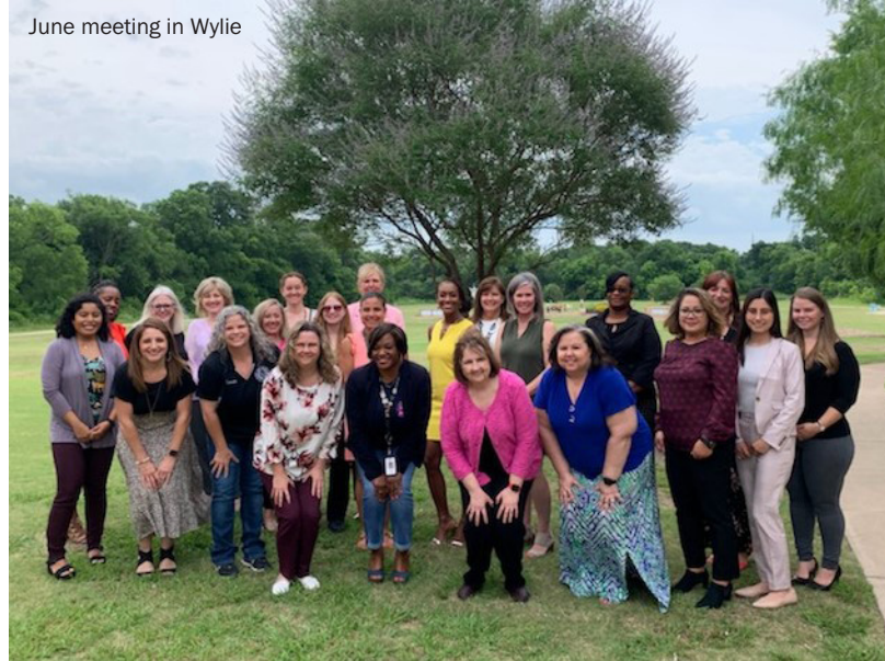
June meeting in Wylie