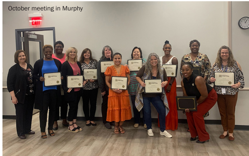
October meeting in Murphy