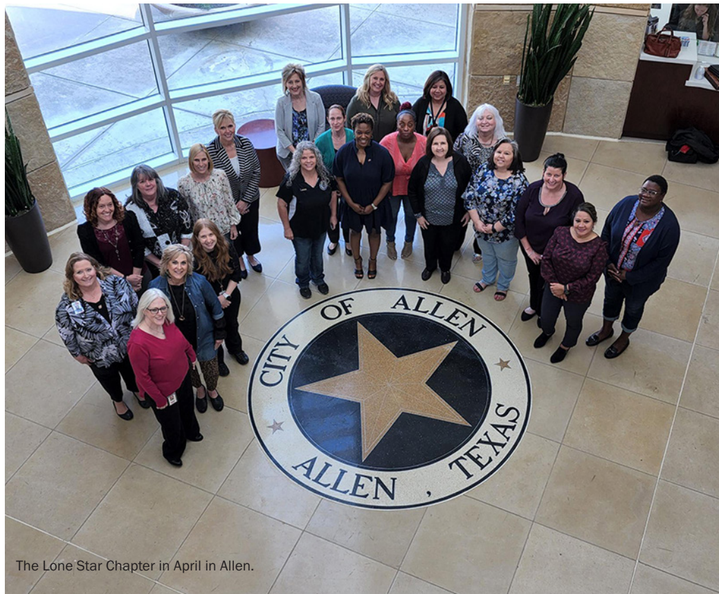
The Lone Star Chapter in Allen.