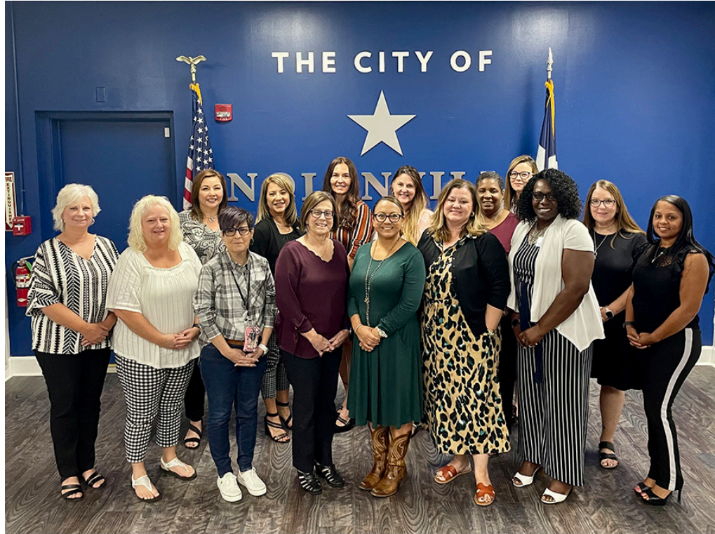
Above: Members of the Central Texas Chapter with honored guests during the chapter’s quarterly meeting at the City of Nolanville.