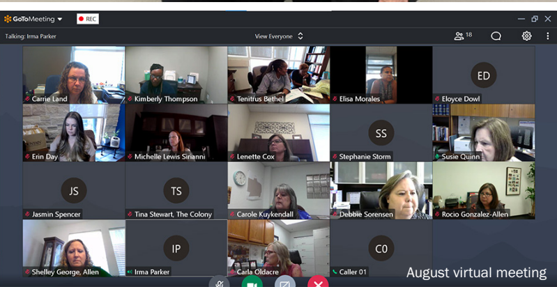
August virtual meeting