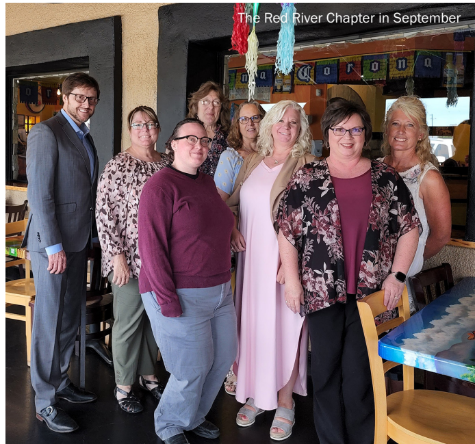
The Red River Chapter in September