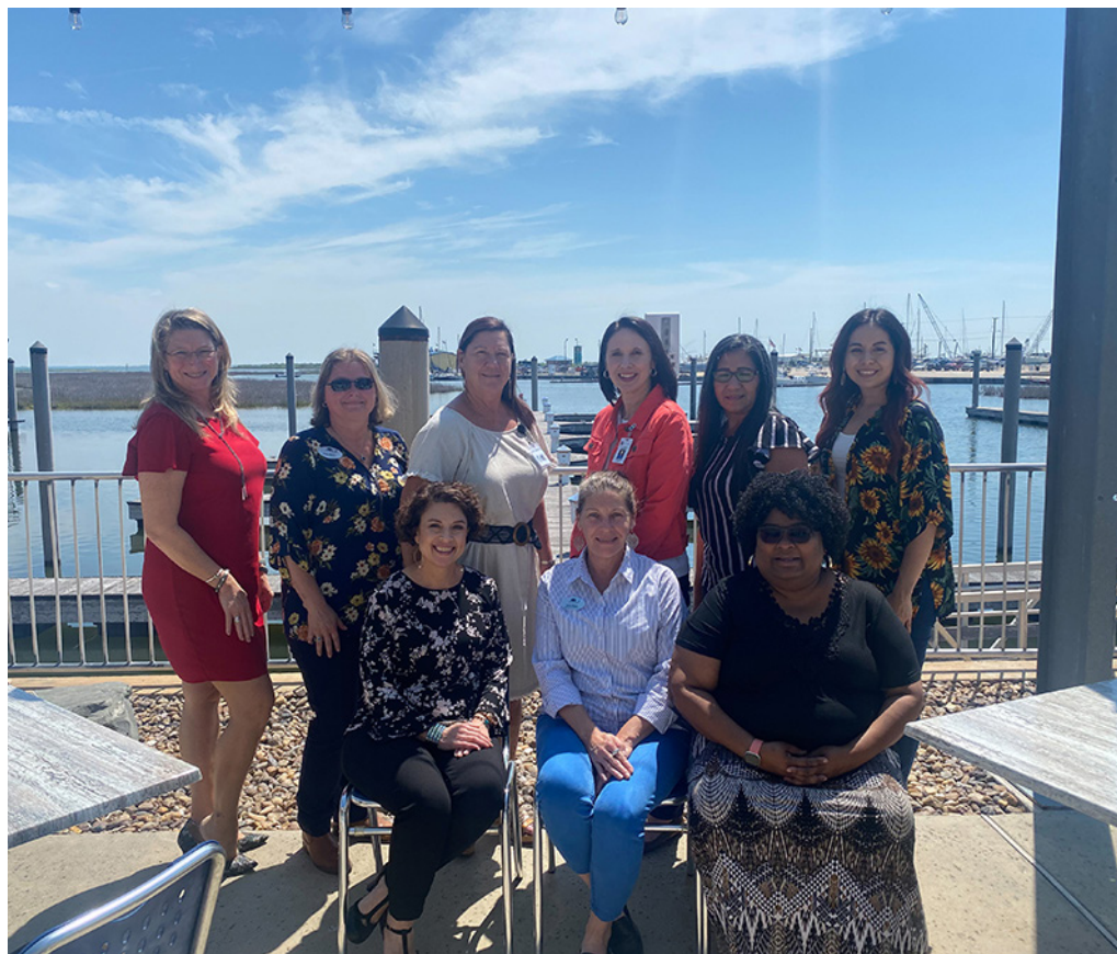
Below: The Coastal Bend Chapter at their quarterly meeting in the City of Rockport.