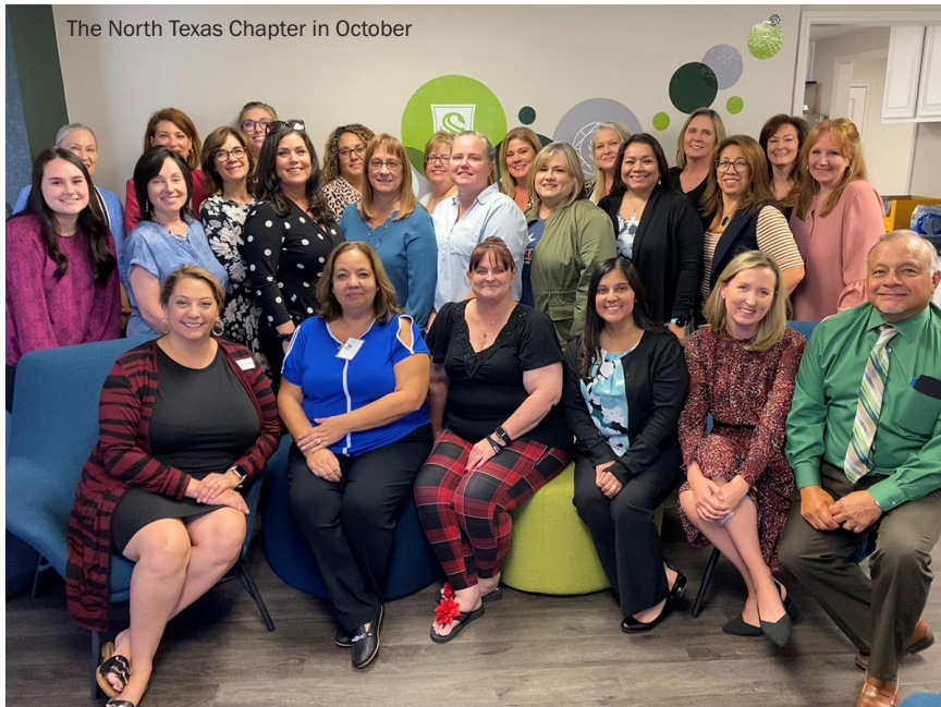
The North Texas Chapter in October

If you are interested in joining our chapter or visiting one of the meetings, please visit the chapter website at www.ntmca.org or contact me at aholloway@cityofjoshuatx.us for more information. We would love to have you as part of our fantastic chapter. •