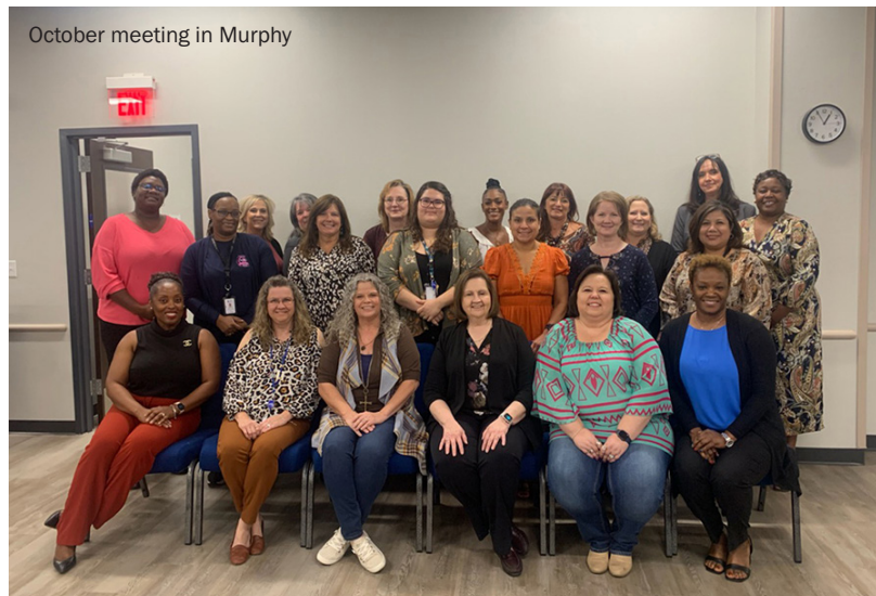
October meeting in Murphy