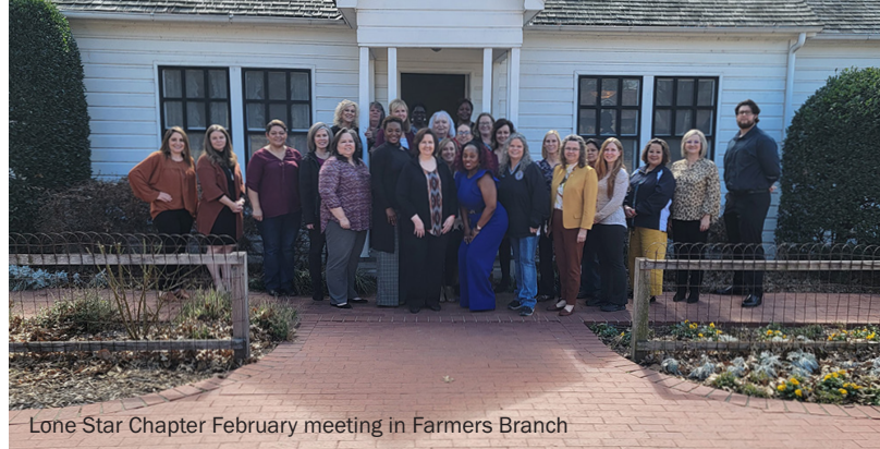
Lone Star Chapter February meeting in Farmers Branch