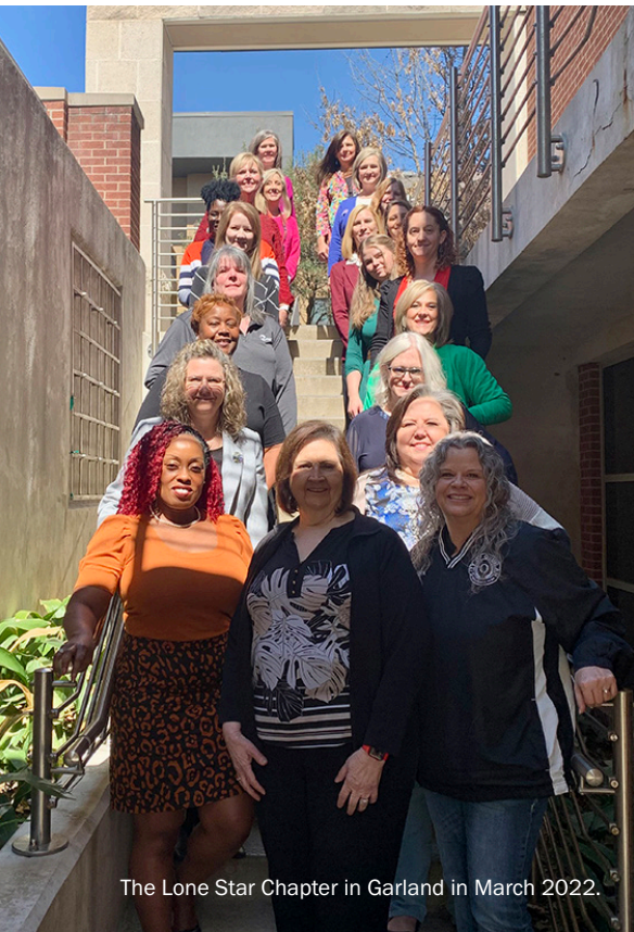
The Lone Star Chapter in Garland in March 2022.