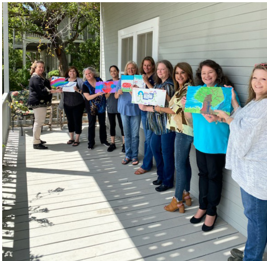
Pictured at right: The Hill Country Chapter at their meeting in Kingsland.